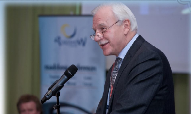
dr Andrzej Olechowski, Former Minister of Finance and former Foreign Affairs