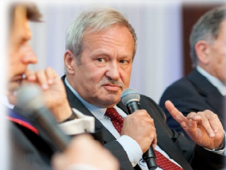
Janusz Steinhoff, Former Deputy Prime Minister, Former Minister of Economy