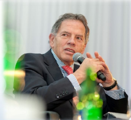
Prof. Dariusz Rosati, Member of Polish Parliament, Former Minister of Foreign Affairs