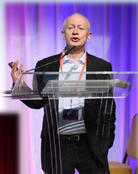
Michał Boni, Minister of Administration and Digitization