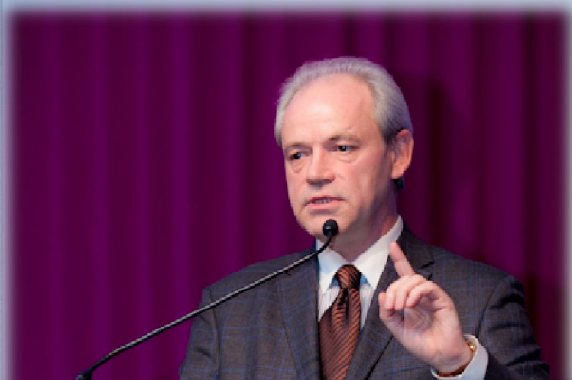
Adam Szejnfeld, Member of Polish Parliament